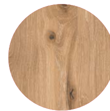
Wild white oak