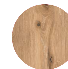
Wild white oak

From a chance meeting and conversations that ensued we discovered that we had much in common; a perfectionist streak, a passion for design that stirs the senses and the relentless spirit for innovation. With the boundaries between bathroom and living space becoming increasingly blurred a decision was made to pool our expertise for a very special project. Out of this, EDITION LIGNATUR was born.